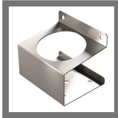
SS Sanitizer Bottle Wall Stand