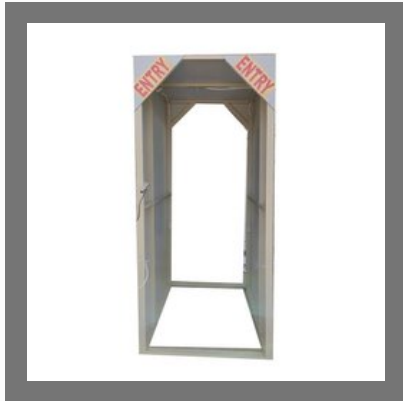
Human Disinfection Tunnel