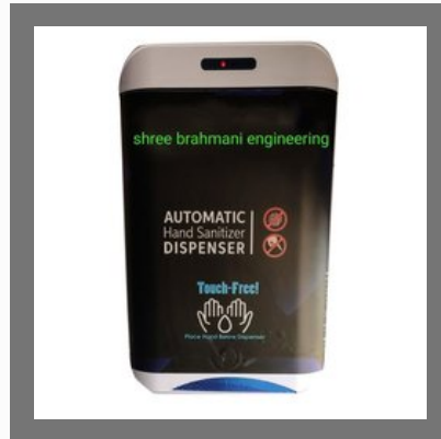
Plastic Automatic Hand Sanitizer Dispenser