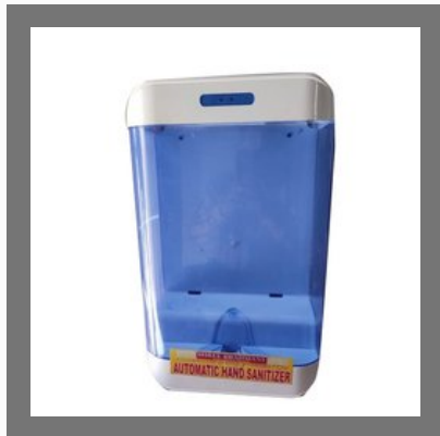
Wall Mounted Automatic Hand Sanitizer Dispenser