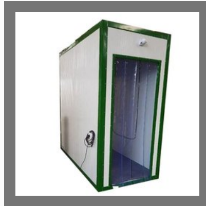
Full Body Disinfection Sanitizer Tunnel