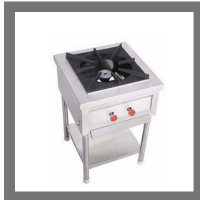
Single Burner Cooking Range