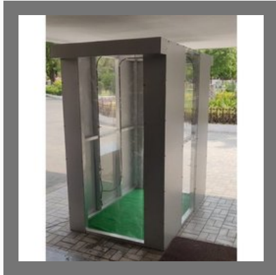
PVC Disinfectant Tunnel