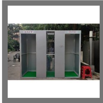
Automatic Humidifier Disinfectant Tunnel