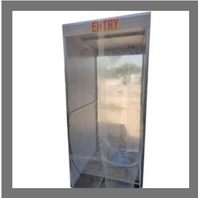
MS Disinfection Tunnel