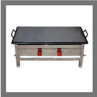
Table Top Dosa Hot Plate